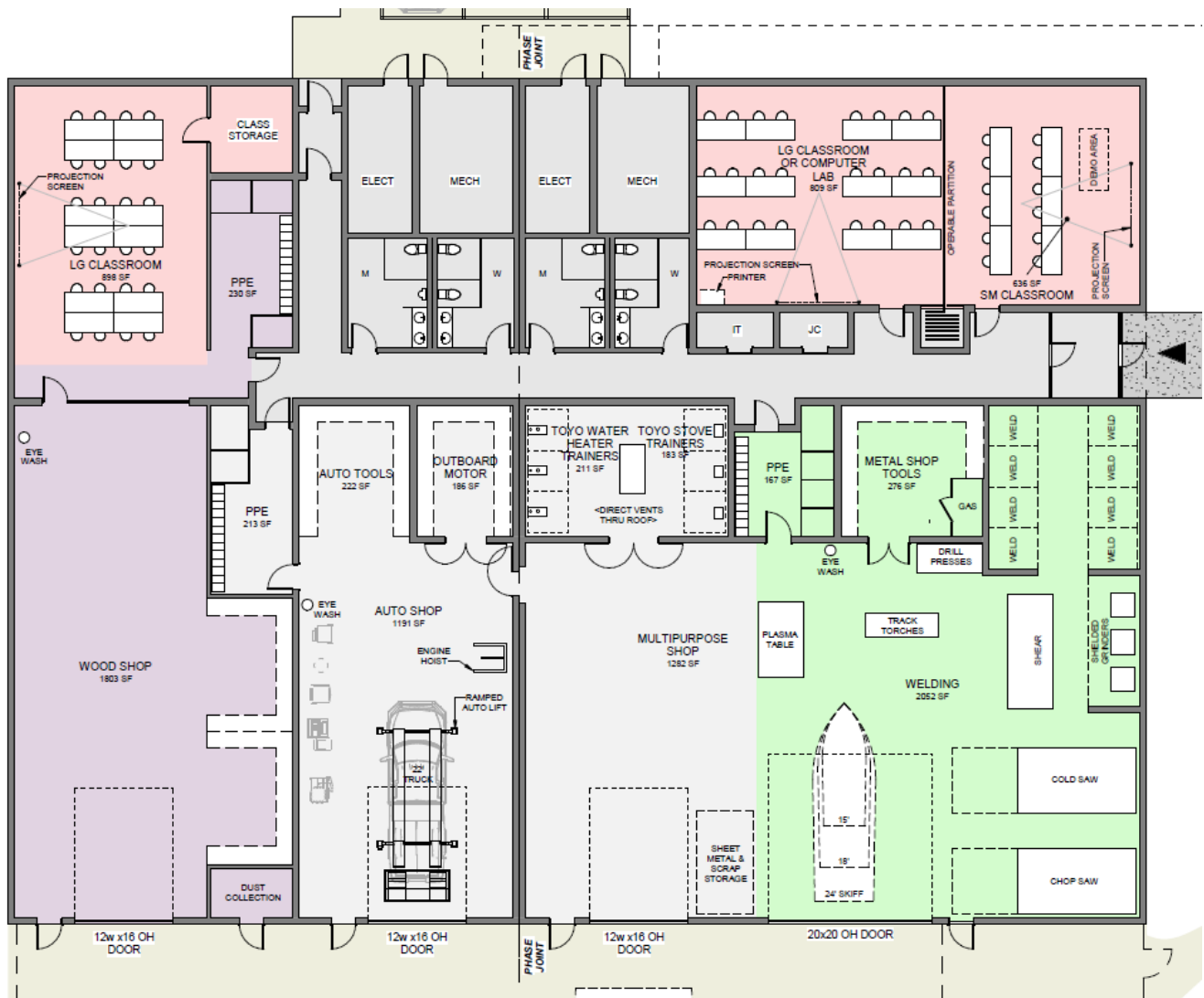
Phases 2 & 3 Conceptual Design drawing with multipurpose shop, metal shop, auto shop, wood shop, and classrooms.

The third phase adds an auto shop and a wood shop with additional classroom space to the left of Phase 2 & 3 Conceptual Design drawing (preliminary) below. (The phase joint is approximately the middle of the grey area.) Phase 3 is expected to be 6,423 square feet for a future (eight years) cost of $10,477,706.