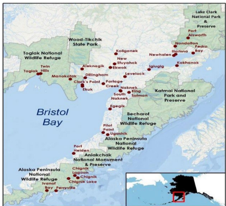
SAVEC provides world class education and vocational training in Southwest Alaska

development training in various fields, including Construction, Fisheries, Maritime, and Support Industries. SAVEC has the flexibility to quickly respond to workforce development needs and is governed by an eight- member board of directors representing regional organizations, Bristol Bay Campus, and local municipal governments.