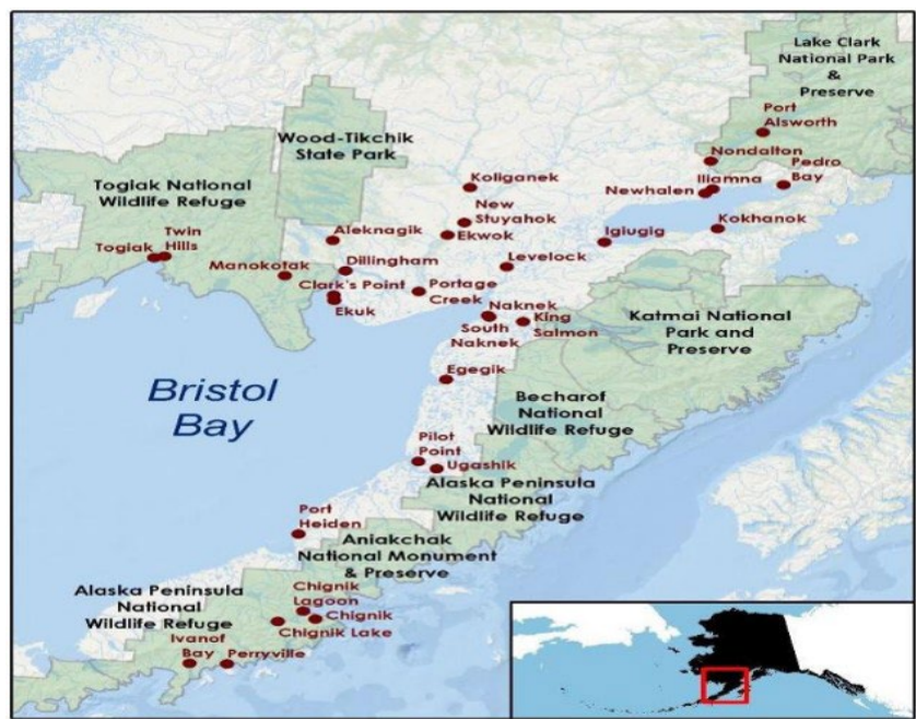
SAVEC provides world class education and vocational training in Southwest Alaska

Construction, Fisheries, Maritime, and Support Industries. SAVEC has the flexibility to quickly respond to workforce development needs and is governed by an eight-member board of directors representing regional organizations, Bristol Bay Campus, and local municipal governments.